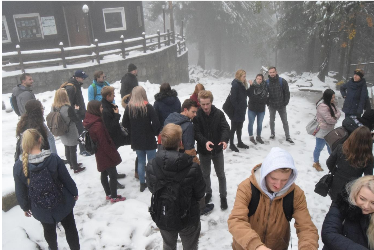
Study excursion - waterfall Kamieńczyka