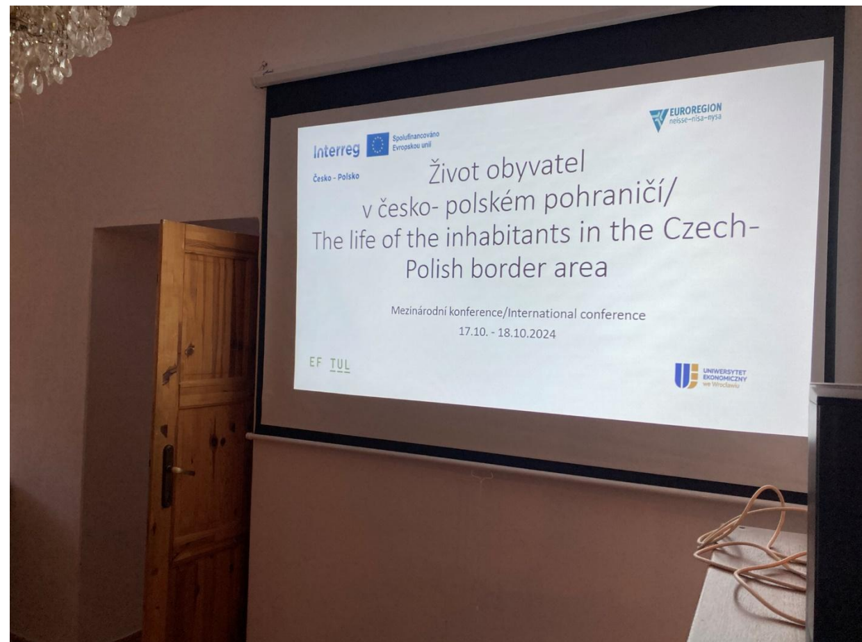
Obří sud- konference Lázně Libverda